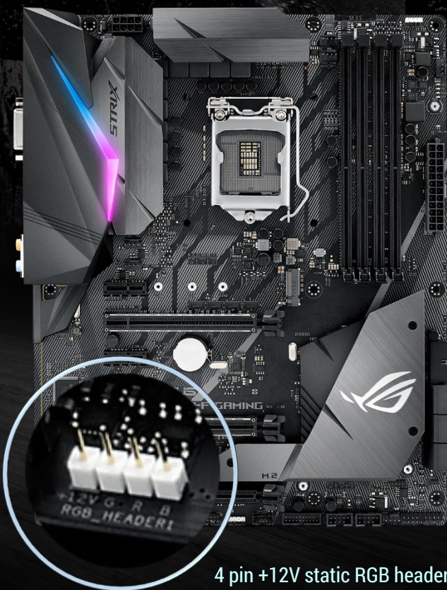
4 pin +12V static RGB header

The Spectre™ RGB was developed in close cooperation with ASUS, thus making it ASUS AURA SYNC ready. Being based on the same technology (+12V with 4pin connector) as other static BitFenix RGB products, such as the cases Aurora and Shogun as well as the Alchemy 2.0 Magnetic RGB Strip, it perfectly matches each other while being controlled by the ASUS Aura software, but also makes it compatible to each of BitFenix' RGB controller.