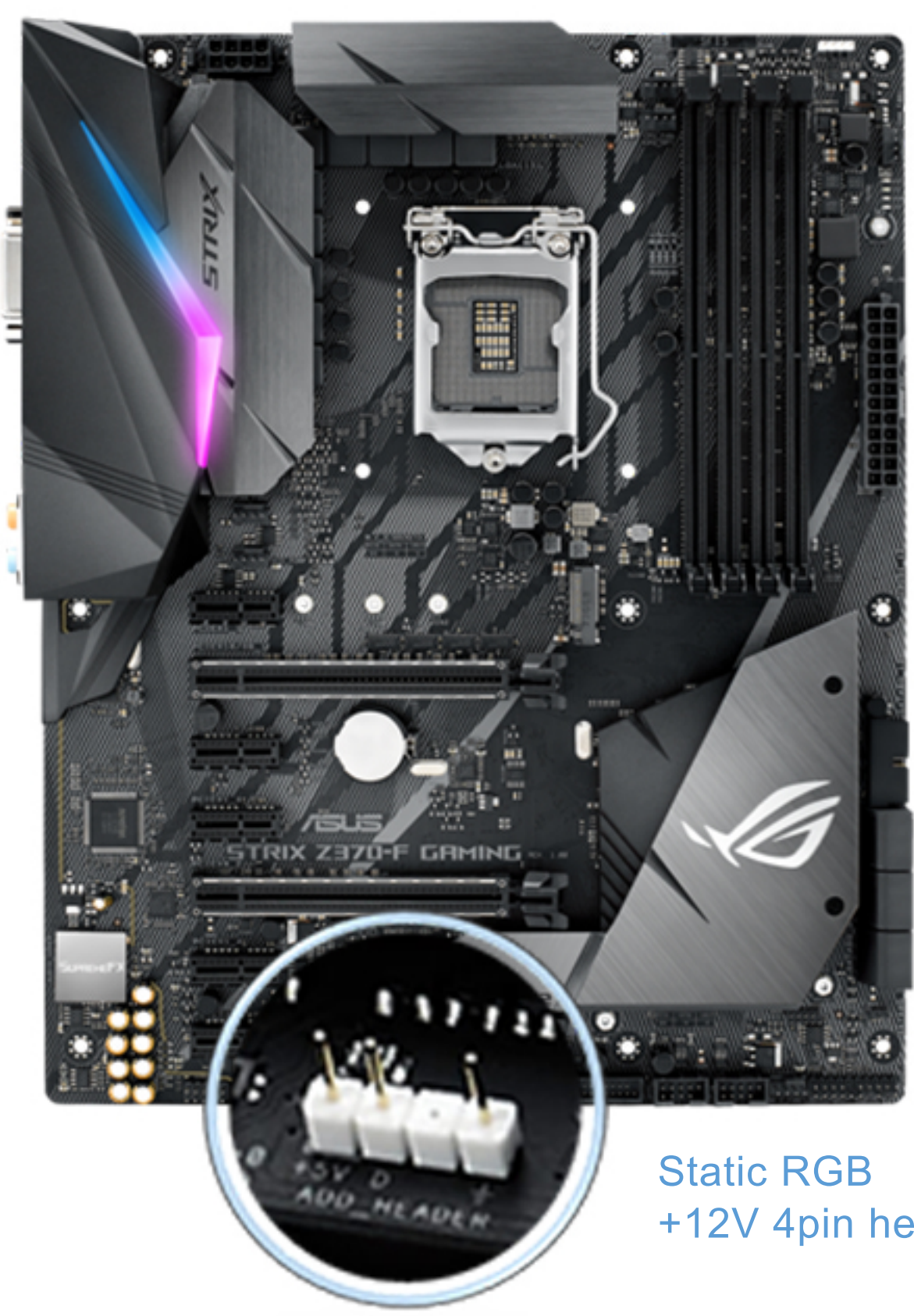
Static RGB +12V 4pin header

BitFenix Alchemy 2.0 Magnetic RGB LED-stripe Pack – 40cm X 2 takes PC DIY illumination to the next level with static RGBs, increasing lighting possibilities with multiple colors on one strip. Being an upgrade from the Alchemy 2.0 Magnetic LED Strips, the upgraded version comes with the high build quality and durability our users are accustomed to, modders and gamers alike.