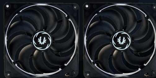
Two 120mm Spectre™ Fans Included