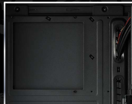
CPU Cooler Cutout and Rubber Grommets