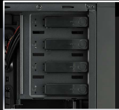
Tool-free Drive Locking