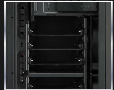
Removable Hard Drive Cage Wall